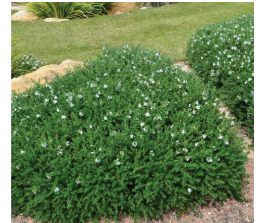
Westringia fruticosa 'WES05' PBR 'Mundi'