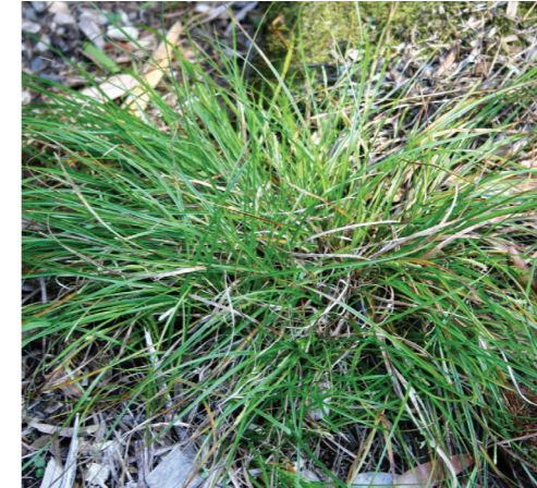
Carex breviculmis *