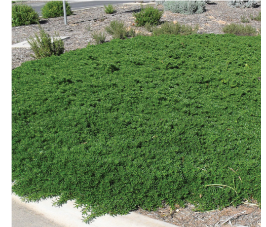
Myoporum fine leaf