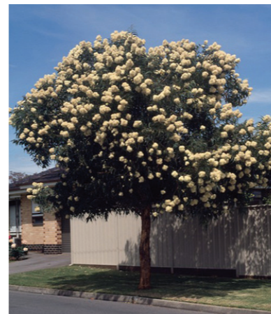
Corymbia eximia nana