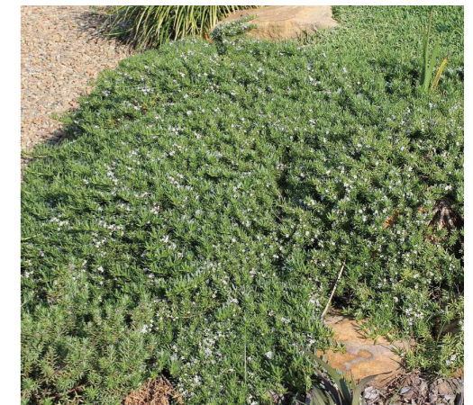
Myoporum parvifolium 'PARV01' PBR Yareena